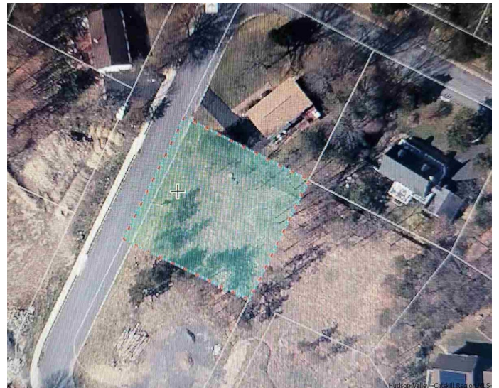
Hudson Valley -Catskill Region MLS-